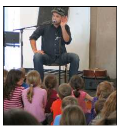
The Music Man