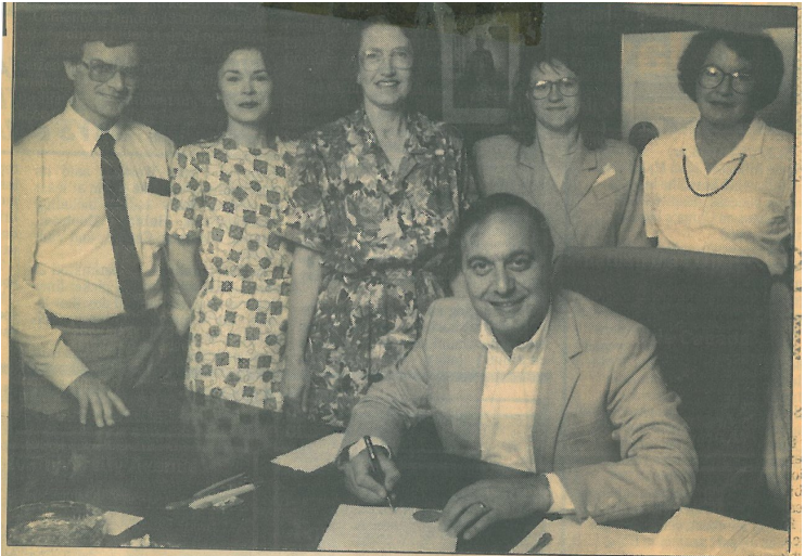
REPRESENTATIVES of literacy organizations met recently with Premier Ghiz to share in his proclamation for the observance of Sept. 8 as World Literacy Day. Shown above

Pictured on the left is Premier Joseph Ghiz proclaiming International Literacy Day on September 8, 1991, one year after the Alliance was established.